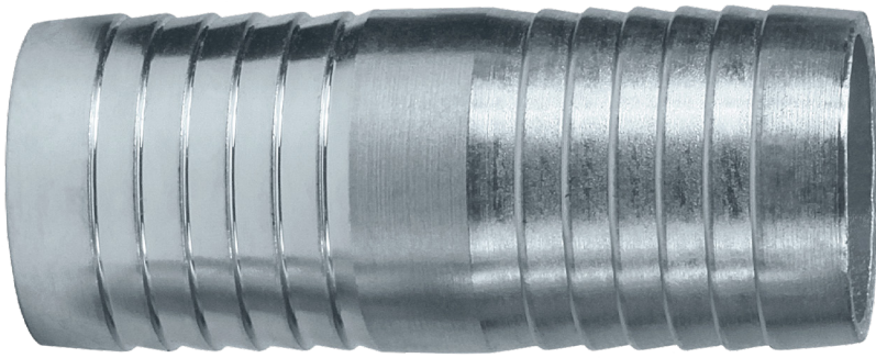
ZINC PLATED STEEL